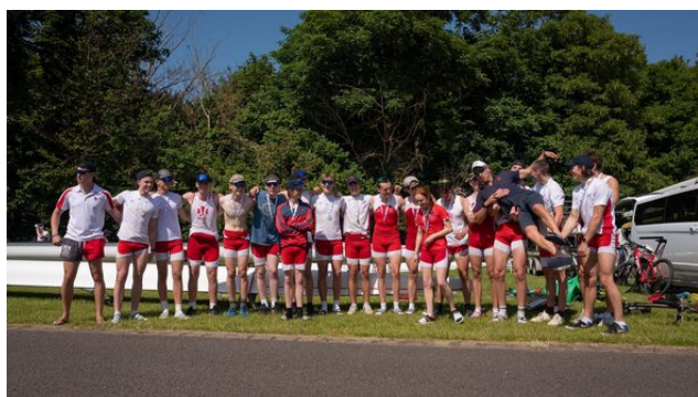
National Schools' Regatta