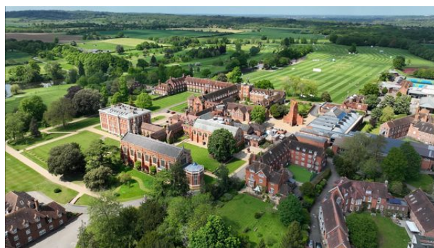
Campus Drone Shots