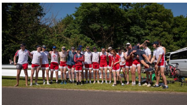
National Schools' Regatta