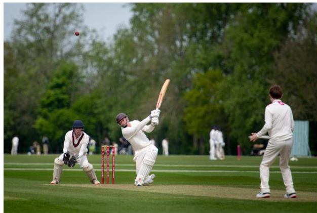
Summer Sports Film