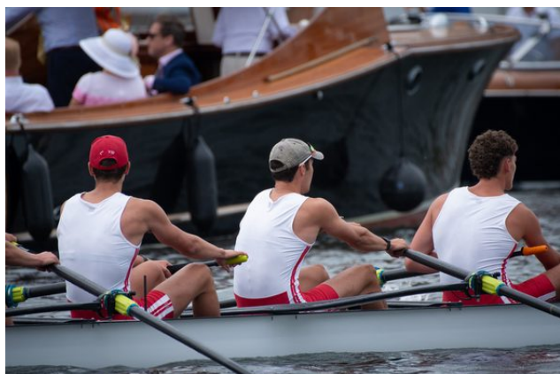
The Process - 1st VIII