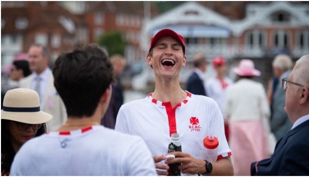
Henley Royal Regatta