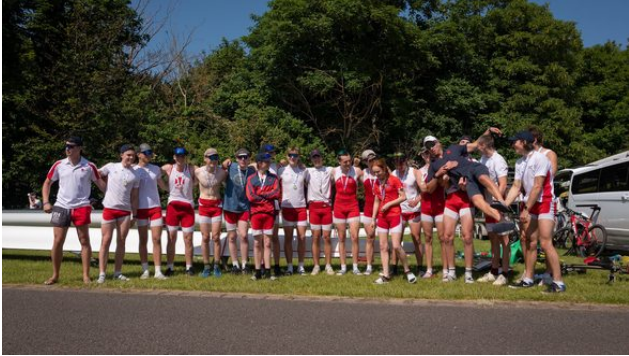
National Schools Regatta