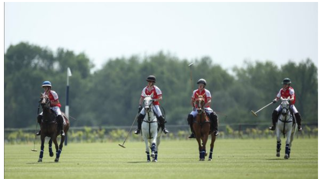
Polo vs Rugby