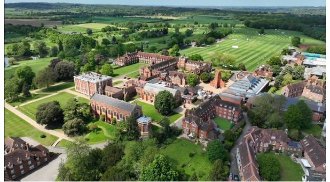
Campus Drone Shots