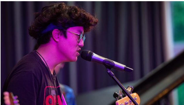
Battle of the Bands