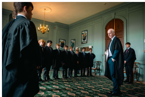
Code of Conduct