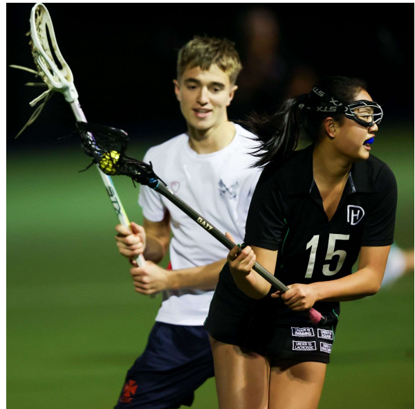
Lacrosse vs Downe