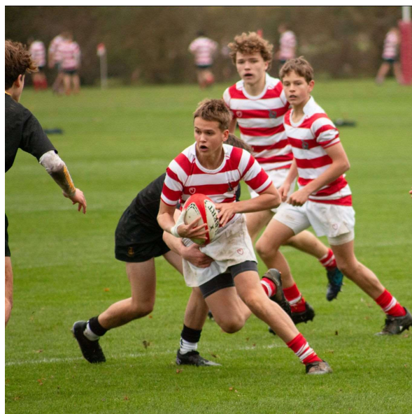
Radley vs Wellington