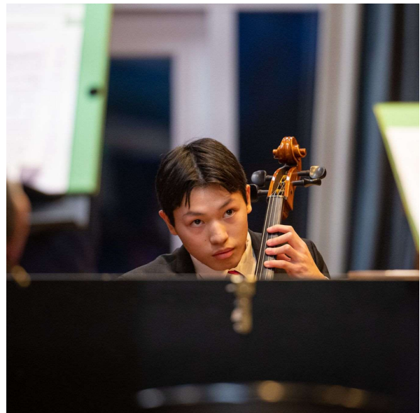
Hudson String Prize