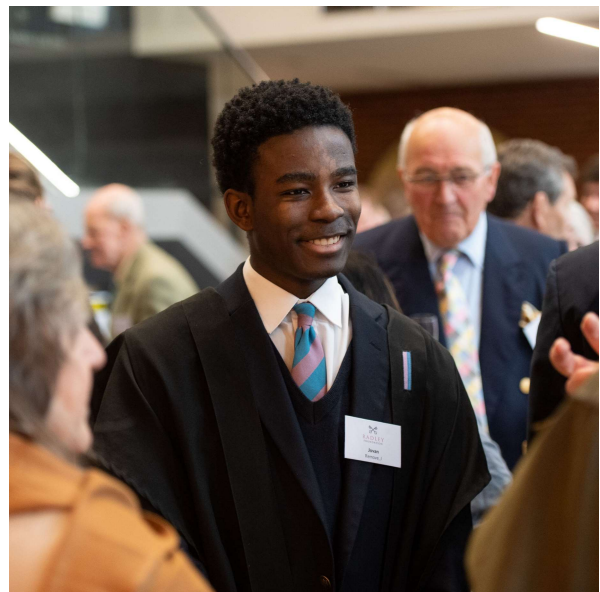
The Radley Keys Award