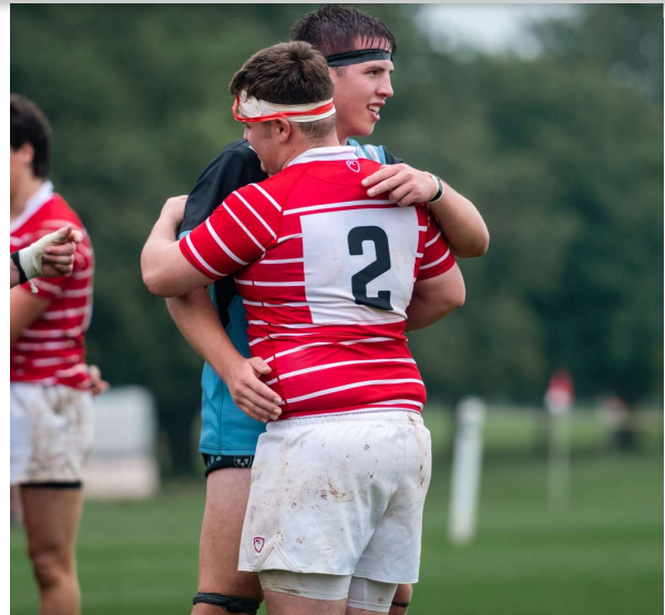
Rugby vs Eton