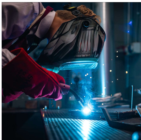
Art, Design & Physics