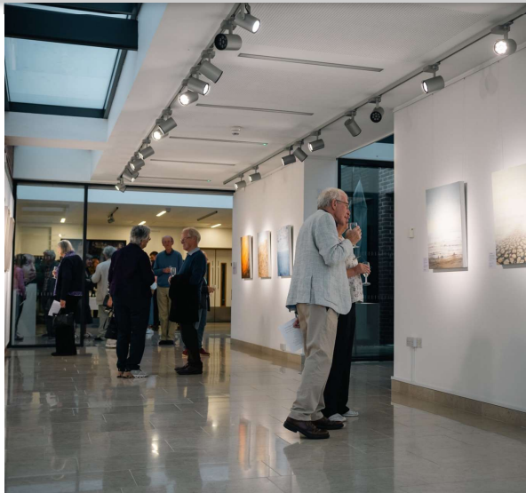
SCG Private View