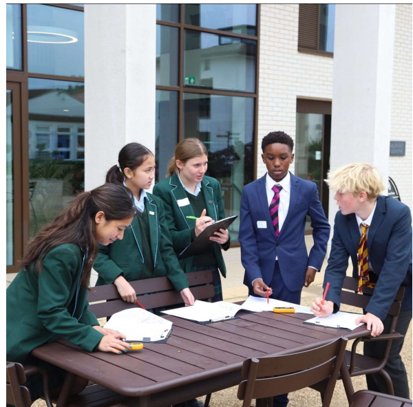
Shells at Downe House