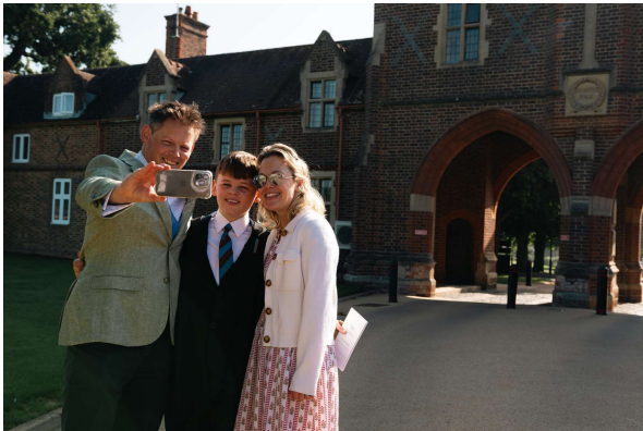
First Day of Term

All our photography is available to download from Flickr . We are grateful to our professional, boy and in-house photographers for their support.