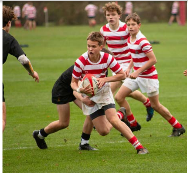
Radley vs Wellington