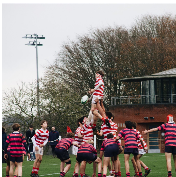
JC1 vs Cheltenham

All our photography is available to download from Flickr . We are grateful to our professional, boy and in-house photographers for their support.