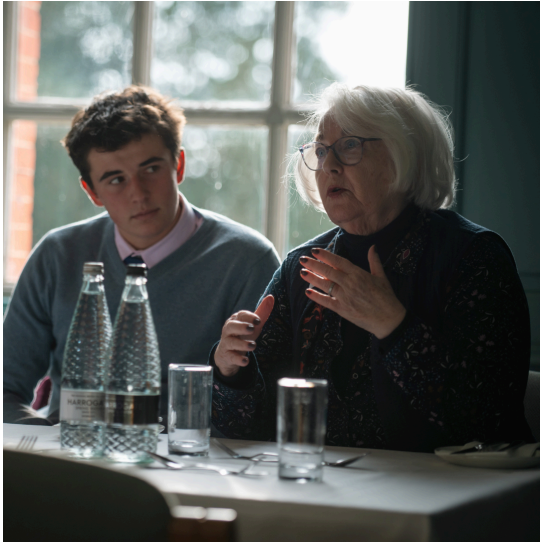
Holocaust Study Day