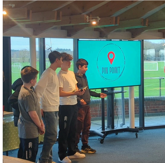
Shell Business Game