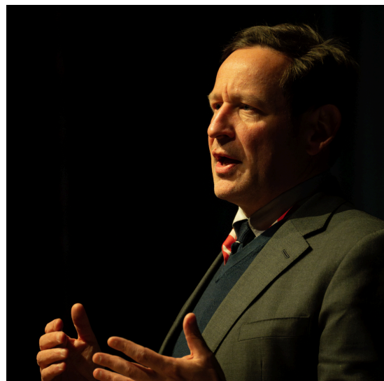
Lord Vaizey Talk