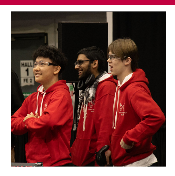
Vex Robotics Nationals