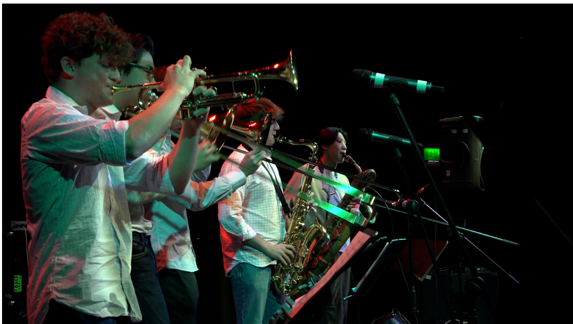
Battle of the Bands