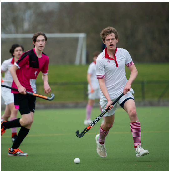
Sport - March 2024