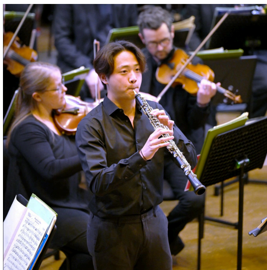
Concerto Concert 2/2