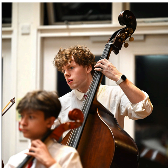
Concerto Concert 1/2