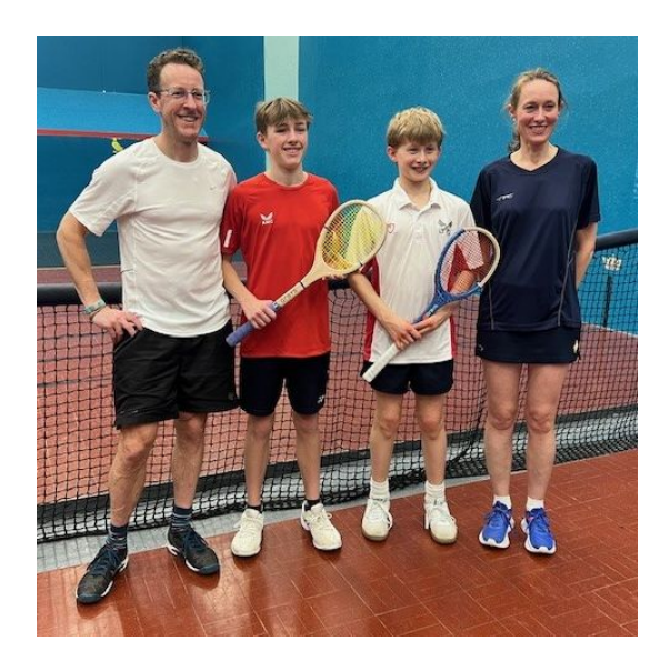
Family Real Tennis

This was the final week of the Community Partnerships Programme where boys have worked alongside local schools, charities, the village community and social enterprises. Since September, 160 boys and 29 dons have committed to 20 weeks of volunteering, providing more than 3,000 hours of support. In this short <u>summary</u> <u>document</u> we share an overview of the impact on those we work with and our boys.