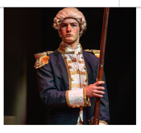
Our Country's Good