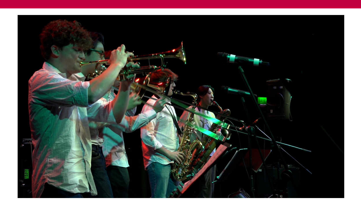
Battle of the Bands