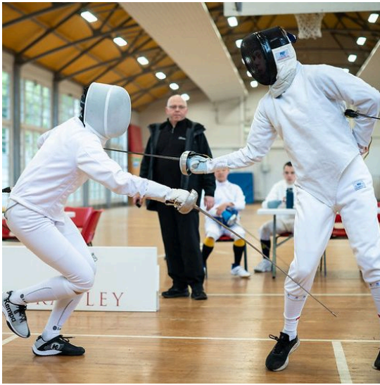
Fencing vs Teddies