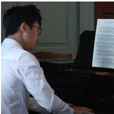
Wharton Piano Prize