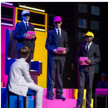
The Fated Finalists