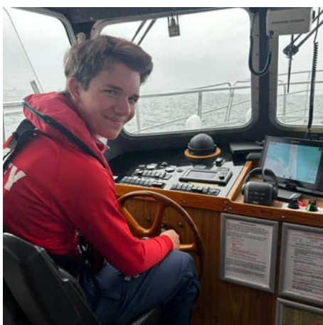
CCF Field Exercise