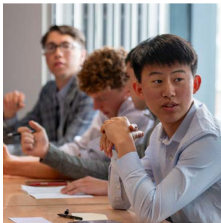
Frank Luntz Debate