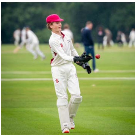
Cricket vs Eton

capture the true essence of Radley. As ever, all photographs are available to download from Flickr .