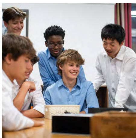
G Social Cocoa