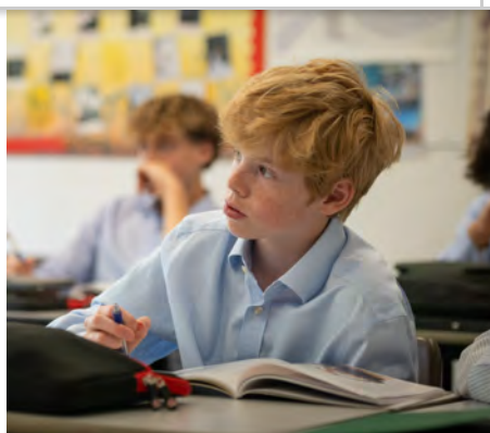
Lessons and Library