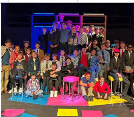
The Fated Finalists