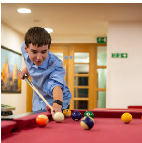
J Social Cocoa