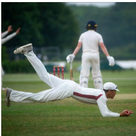
Cricket and Tennis

capture the true essence of Radley. As ever, all photographs are available to download from Flickr .