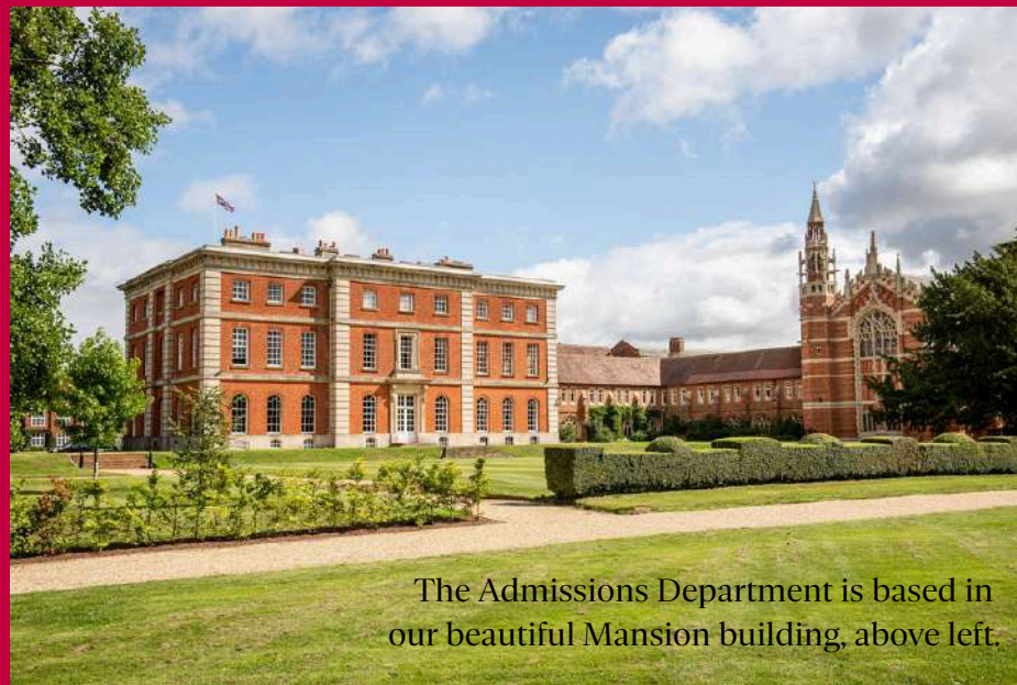
The Admissions Department is based in our beautiful Mansion building, above left.

The School Registrar is a senior member of the Radley Admissions team. As Registrar, you will hold key accountability for the operational management of the admissions process, ensuring that prospective families experience a seamless and welcoming journey, and that Radley's admissions operations remain efficient, effective, and aligned with the College's broader objectives. Your leadership will be critical to the continued success and growth of Radley College's admissions.