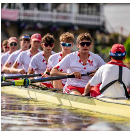
Henley Royal Regatta - Princess Elizabeth Cup

We are grateful to all our professional, staff and boy photographers who work hard to capture the true essence of Radley. As ever, all photographs are available to download from Flickr .