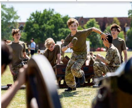
CCF Inspection Day