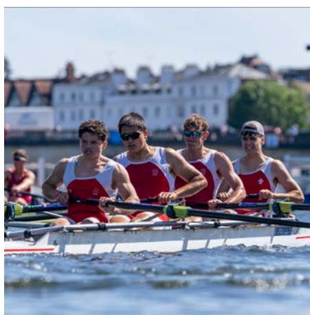
Henley Royal Regatta - Prince Albert Cup