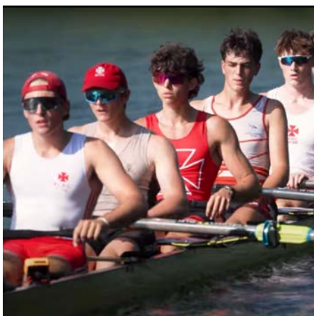
Radley College 1st VIII